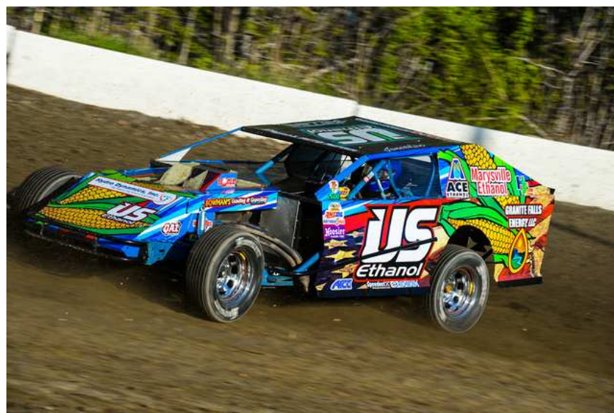
US Ethanol car on track

8 Redmond Court, Rome, Georgia 30165 · 706-234-4111 info-hdi@hydrodynamics.com · www.hydrodynamics.com